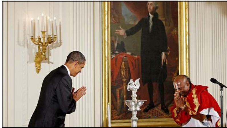
Diwali candle ceremony held beneath Washington's portrait in the White House, September 25, 2009

graduates are ignorant of why the Tree of Liberty grew in the soil of a robust Christian culture.